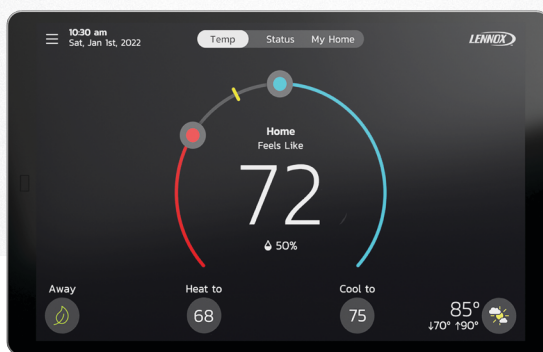
S40 Smart Thermostat