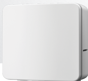
Smart Air Quality Monitor

Complement your system with our suite of technologically advanced accessories to more precisely and efficiently maintain the temperature and air quality in your home. Altogether, It's the most advanced accessories package available that delivers next-level perfect air.