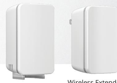
Smart Room Sensor